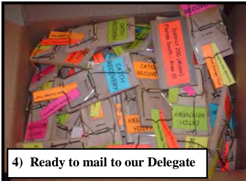
4) Ready to mail to our Delegate