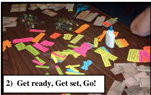
2) Get ready, Get set, Go!