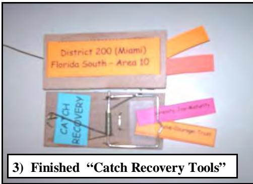
3) Finished "Catch Recovery Tools"