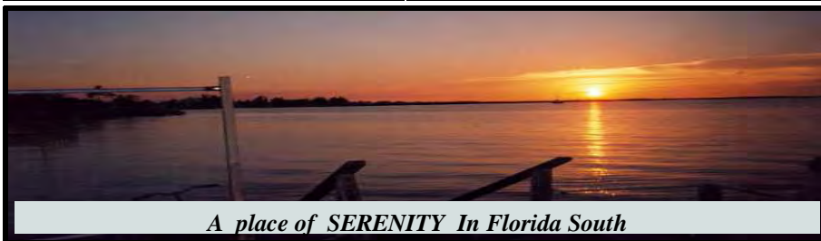
A place of SERENITY In Florida South

2013 International Al-Anon Convention: More information to follow.