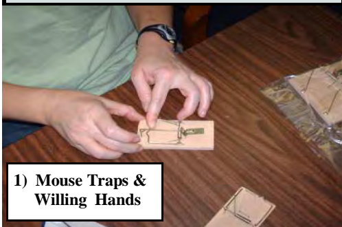
1) Mouse Traps & Willing Hands