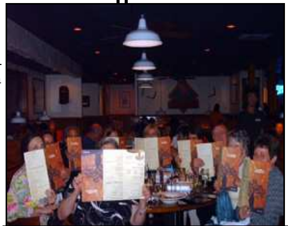
Our anonymous dinner photo.